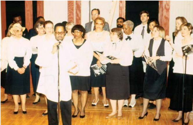
Gospel Choir, 1980s.