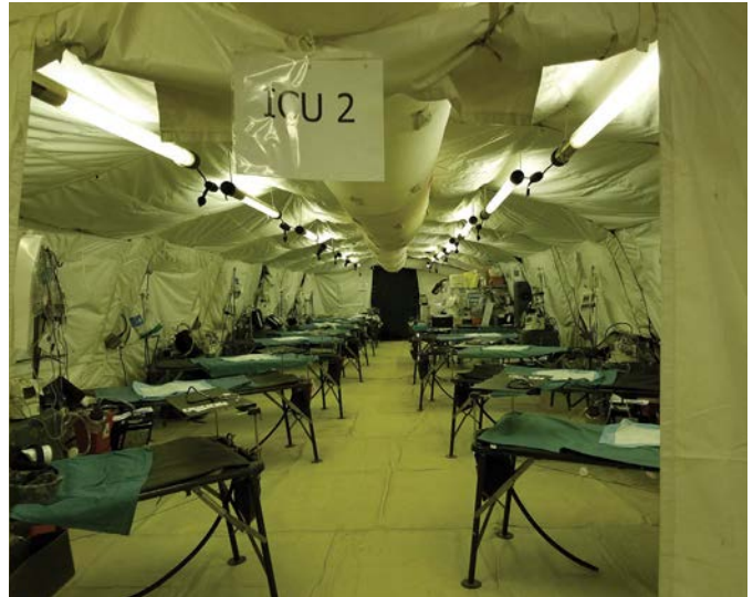
The ICU of a 440-bed hospital unit getting ready for deployment.