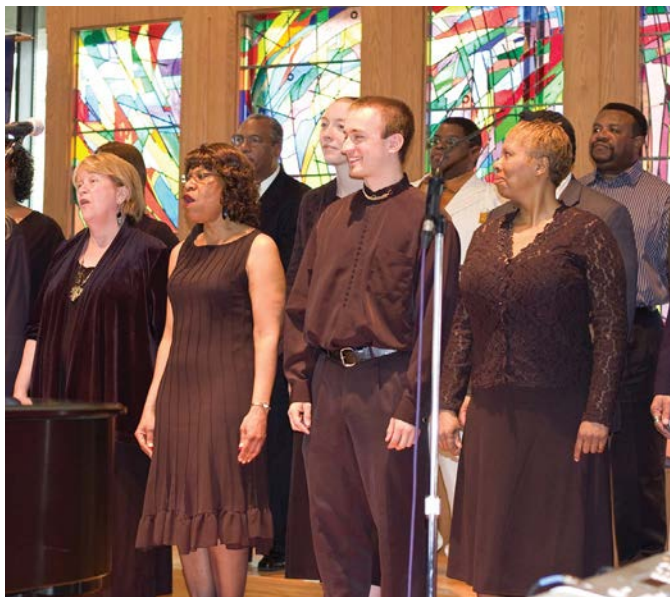
Members of the 2007-08 Gospel Choir

At LSTC Gospel Concerts, the sound of praise coming from the singers, keyboardists and other musicians just about lifts the roof off the Augustana Chapel. It is impossible to sit still and listen. Surrounded by that much sound and that much heart, you can't help clapping or moving to the music. On April 8 at 4 p.m., the LSTC Gospel Choir will hold its 30th annual concert, quite a milestone for a group that started as a pick-up choir.