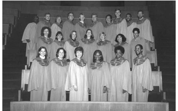
Gospel Choir, 1990s.

She added, “I am most grateful that the Gospel Choir could give a different kind of worship experience to the LSTC community. Not everyone at LSTC is Lutheran or White. This was important to me from the beginning. Having my own tradition become part of the worship experience at LSTC meant everything to me. I was glad that it was accepted.”