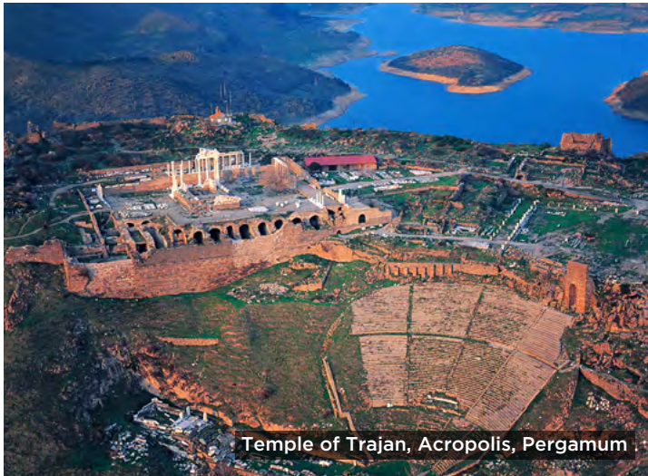
Temple of Trajan, Acropolis, Pergamum

one letter here. We will spend the morning walking the city's marble streets, visit the magnificent Terrace Houses, Celsus Library, theatre (Acts 19), and the Double Church where the ecumenical Council of 431 CE/AD took place; St. John's Church, and the Selçuk Archaeological Museum (B,D)