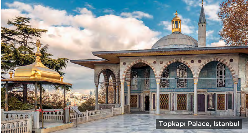
Topkapı Palace, Istanbul