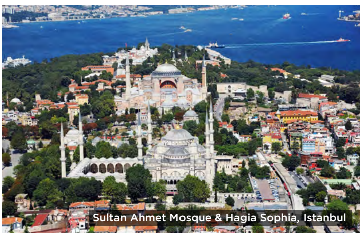
Sultan Ahmet Mosque & Hagia Sophia, Istanbul